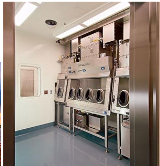
Necropsy suite at CDC’s new BSL-4 suite of laboratories.