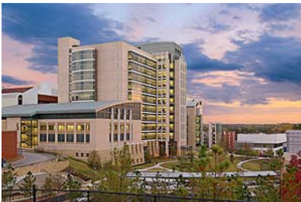
“The new Emerging Infectious Diseases Laboratory occupies a central space on the CDC’s Roybal Campus near Emory University in Atlanta. It consists of two wings: a high-rise lab and office tower (right) and a six-story high-containment lab, vivarium, and glasswash facility (left). (The curved-roofed building at the far right is Building 17, the Infectious Disease Laboratory; Building 15, a containment lab, is the white element

On June 15, 2007, lightning struck in and around the CDC’s new $214 million infectious disease building on Clifton Road, Atlanta, including the suite of six BSL-4 laboratories, causing a power surge that knocked out power. Remote backup generators never came on. The outage shut down negative air pressure systems, which keep select agents from escaping the containment areas. (12,13) The BSL-4 labs were uninhabited at the time of the lightning strike/power outage even though construction of the building, which had begun in 2001, had been completed in September 2005. (13) Thus, the public and CDC workers were not placed at any risk as a result of the power outage.