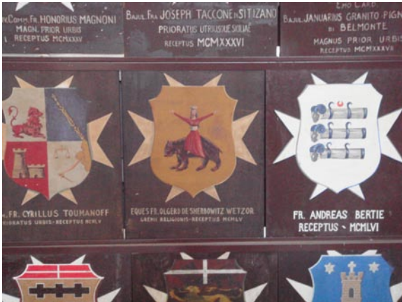
(a church outside Rome)