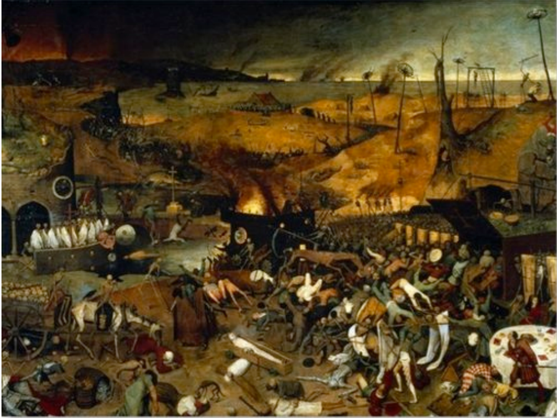
The Triumph of Death, Pieter Bruegel