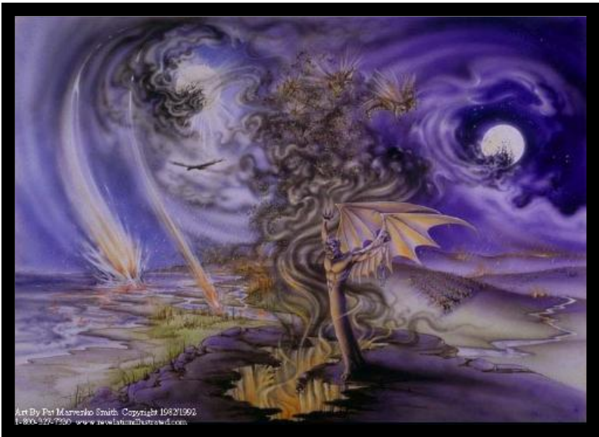
The First Six Trumpet Judgments