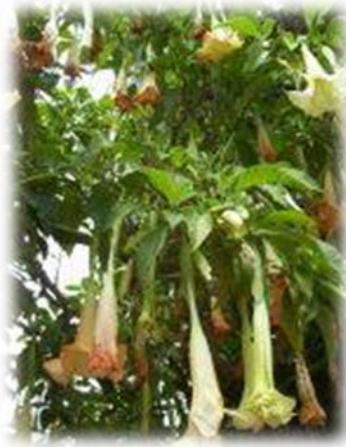
Angel's Trumpet

By examining historical evidence, disease patterns and similar neuro-toxins, scientists are finding strong links to toxins, virus and specifically scopolamine, an active agent of the burundanga plant. Scopolamine has been used for centuries for ritual magic as well as criminal activity in the Western Hemisphere. (National Institutes for Health, 1985).